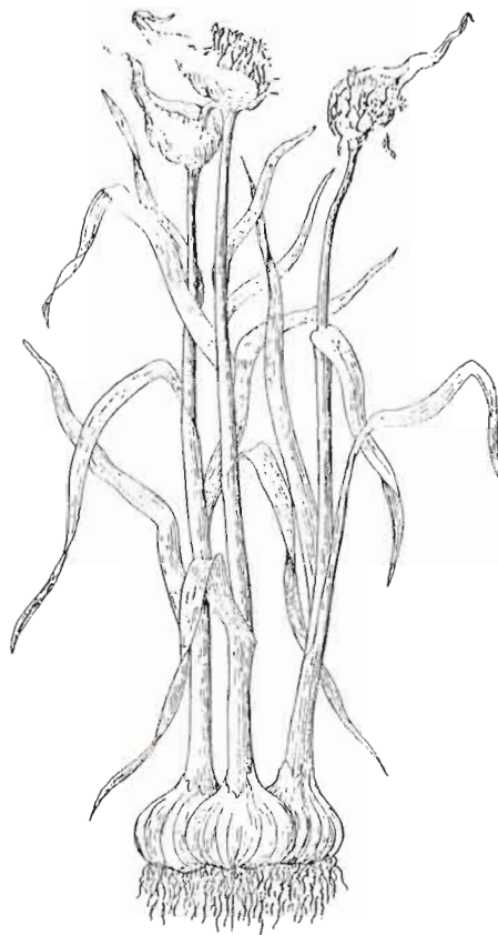
GARLIC ( Allium sativum )

away. To make a topical ointment, I soak a garlic cloves in warm olive oil for 24 hours. For treating ear infection, I put a few drops of the oil in the ear ever few hours. I use this oil for minor abrasions as well as infected insect bites. To treat an ear infection when the garlic ointment is not available, I sometimes just stick a bruised